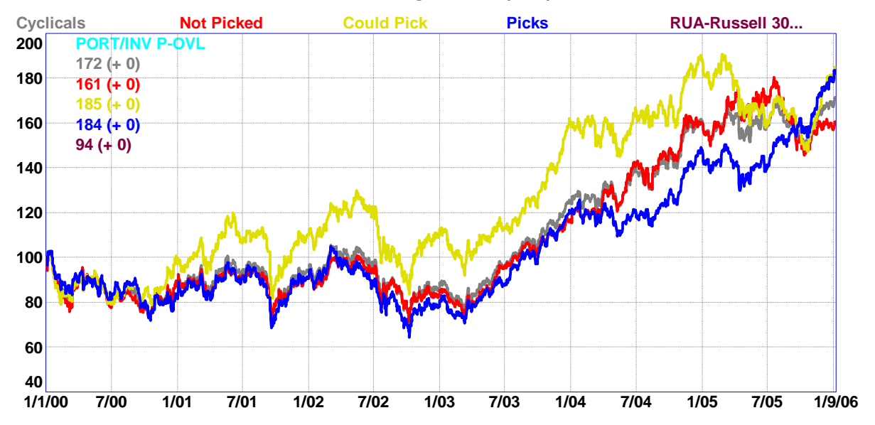
Five-Year Chart, Picks and Non-Picks from Morgan Stanley's Cyclical Stock Price Index.

While I expect this to be a fairly low-turnover strategy, from the chart above it is obvious that one needs to monitor the selections as these stocks do not all move in lockstep. This is evident from the five-year picture shown below.