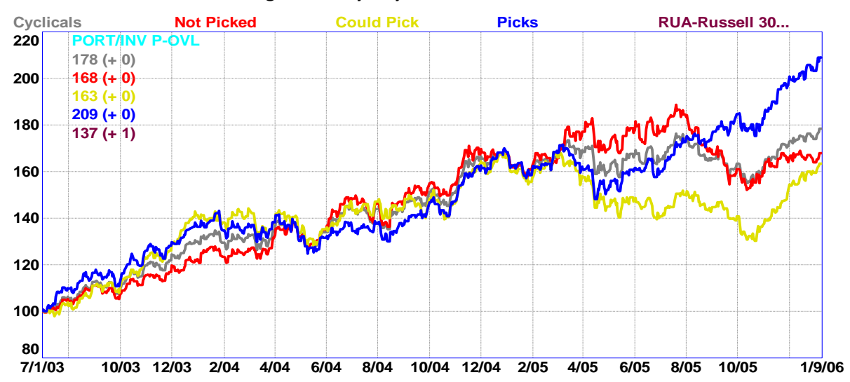
Picks and Non-Picks from Morgan Stanley's Cyclical Stock Price Index.

The chart below is rather busy, but shows the same returns plus that of the Could Pick and Not Pick.